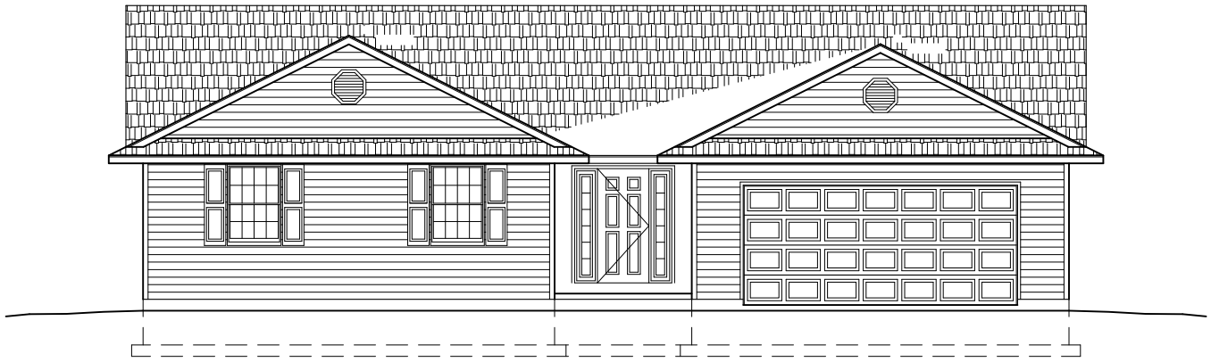
1 FRONT ELEVATION A-1